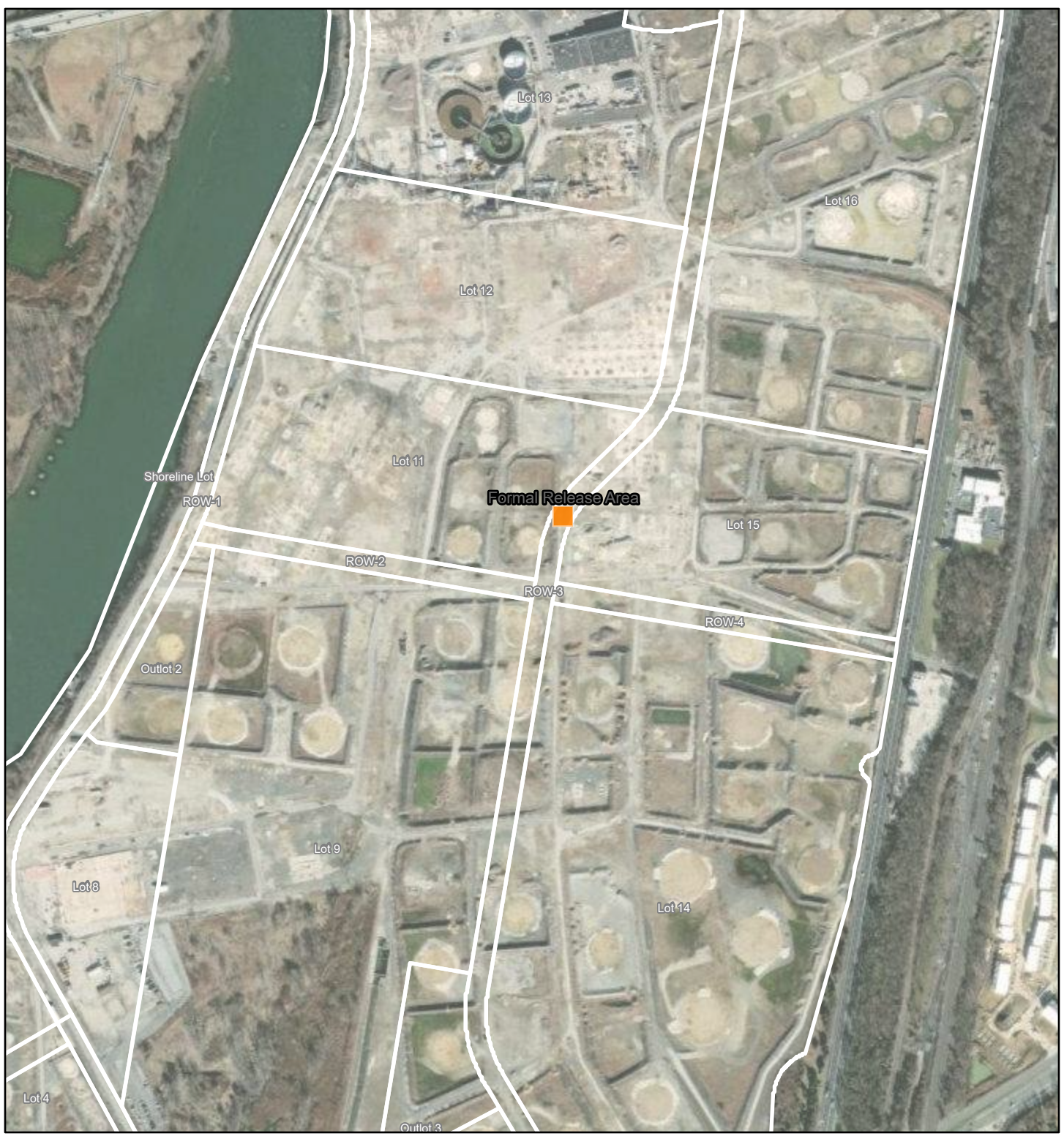
Figure 1 - Right-of-Way- 3 (ROW-3) Release on 6/22/23 Area